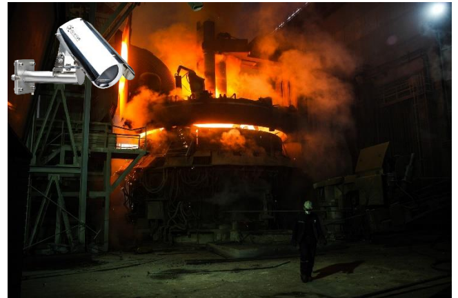
ThermalEye monitoring a furnace

ThermalEye Software offers full remote control of all infrared cameras, different inspection zones configuration, recording functions and analysis of measured data.