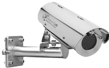
ThermalEye infrared camera